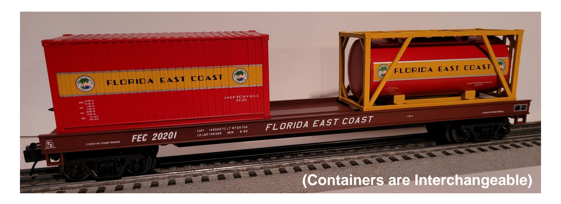
99 cars were ordered by members and delivered in August 2020