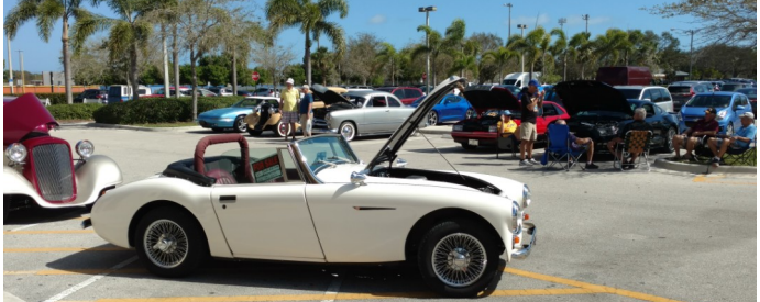
a few of the classic cars outside the Fenn Center