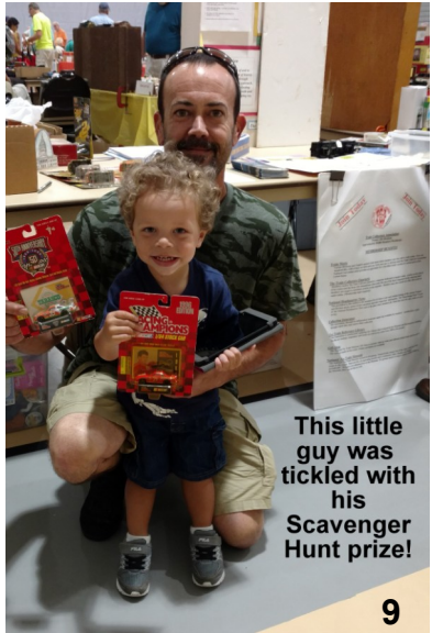
This little guy was tickled with his Scavenger Hunt prize!