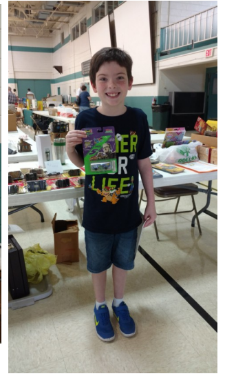
some of the Kids Club Scavenger Hunt winners