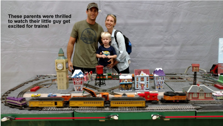
These parents were thrilled to watch their little guy get excited for trains!