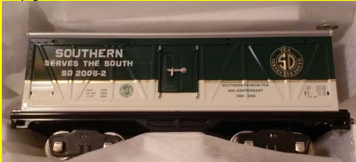
Photo Above: One of the four Standard Gauge boxcars produced by MTH Trains for the Southern Division 40th Anniversary.