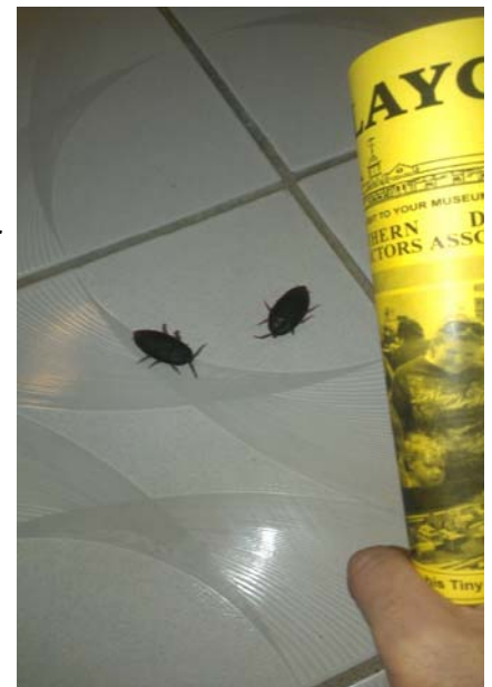
Photo Above: Rather than spending money hiring expensive exterminators, your issue of The Layout can help you take care of that nasty bug problem.

Although Southern Division members can get a PDF copy of The Layout emailed to them faster than a traditional paper copy, many members still receive their copy through the mail. Rather than throwing your copy away after you've read it (or in some cases, before you've read it) we've tried to do our part to preserve the environment and came up with several suggestions for additional uses for the official Southern Division newsletter: