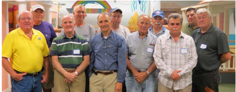
Photo Right: Southern Division Members pose at the Treasure Coast Children Museum in Jensen Beach, FL. Southern Division members built this 8 ft x 24 ft Train layout. See the article, "Toy Trains Come To Jensen Beach," in the latest TCA Quarterly (Vol. 59, No. 2, Pages 30-31) for the complete story.