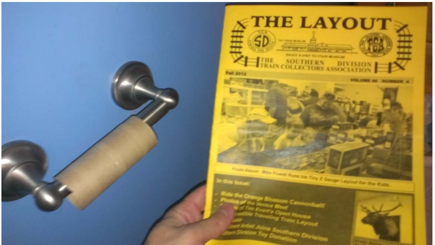
Photo Below: Not only can your issue of The Layout be bathroom reading material but it's available for unexpected emergencies too!

Photo left: The Layout can be used as a nifty cat box liner!