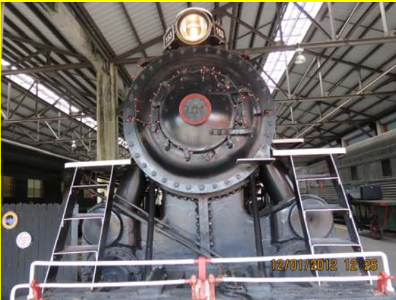
Photo Above: The Gold Coast Railroad Museum displays Florida East Coast #153,

Admission is free to all attendees on Saturday, May 11, 2013. Admission is free on Friday, May 10, 2013 only to all TCA Members and Southern Division Members and their guests. You must show membership identification for free admission on Friday.