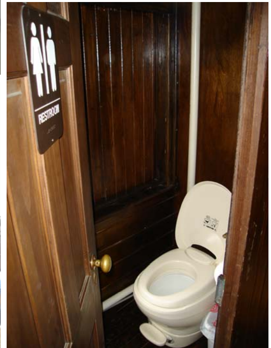
Photo Above: Southern Division members reserved a special seat on the train for the Editor of The Layout .