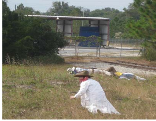
Photos Left: Members of Wicked Willie's gang end up dead. Some members talked about displaying the bodies in the meet hall as a warning to others who might try to steal trains from the Southern Division.