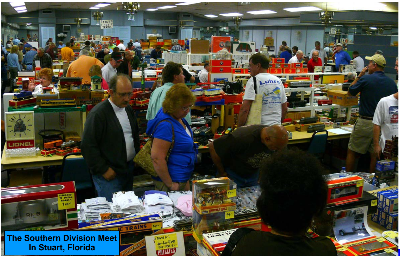
The Southern Division Meet In Stuart, Florida