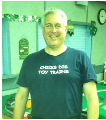
Photo Southern Division Members arrive ready to buy trains.