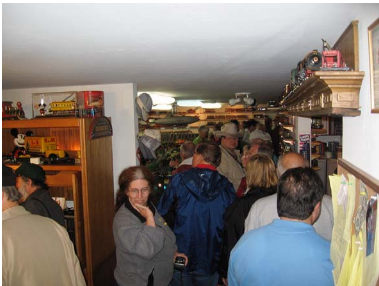
Photo Left: Crowded basement at Chuck's Open House, part of Welcome Party.