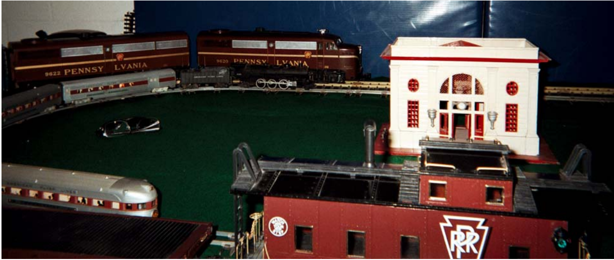
Photos Left, Left Below: Jeff Sawyer's (Meet Host) operating display features S and G Gauge Trains.