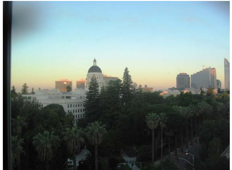
Photo Above: View of the Capitol Building in Sacramento, just after sunrise