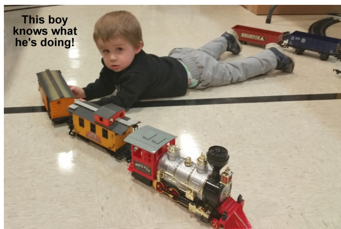
This boy knows what he's doing!